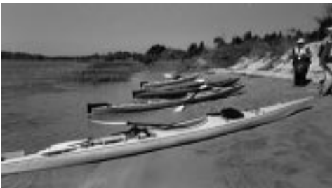
Kayaking near Little Talbot Island, near Jacksonville, Fla.

January 1, 2000 - Millenium Paddle - Everyone's Welcome It's not too early to plan for our Y2Kayak Russ 412.331.2073