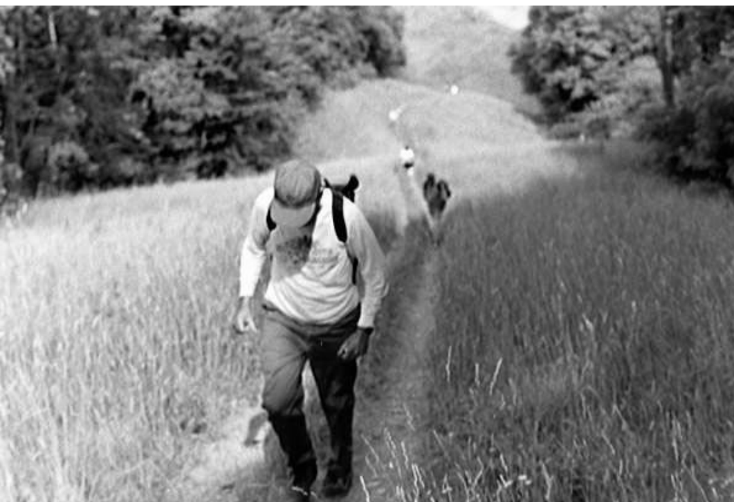
A line of hikers makes its way up the hill at "Mile 14", Rachel Carson Challenge

Order one today! See the order form on the back page for prices.